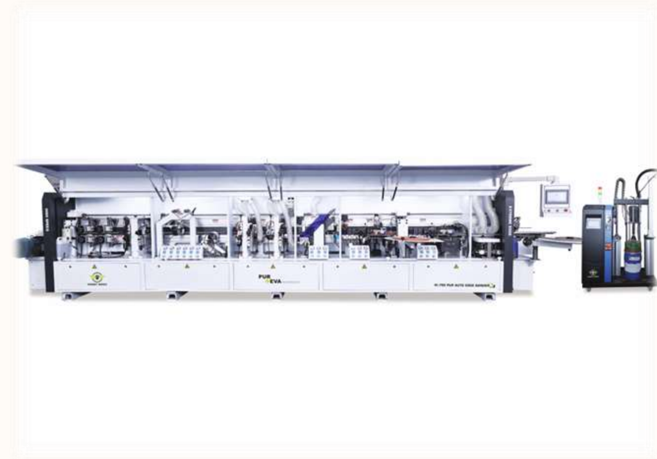
Hi-700 PUR Auto Edge Bander