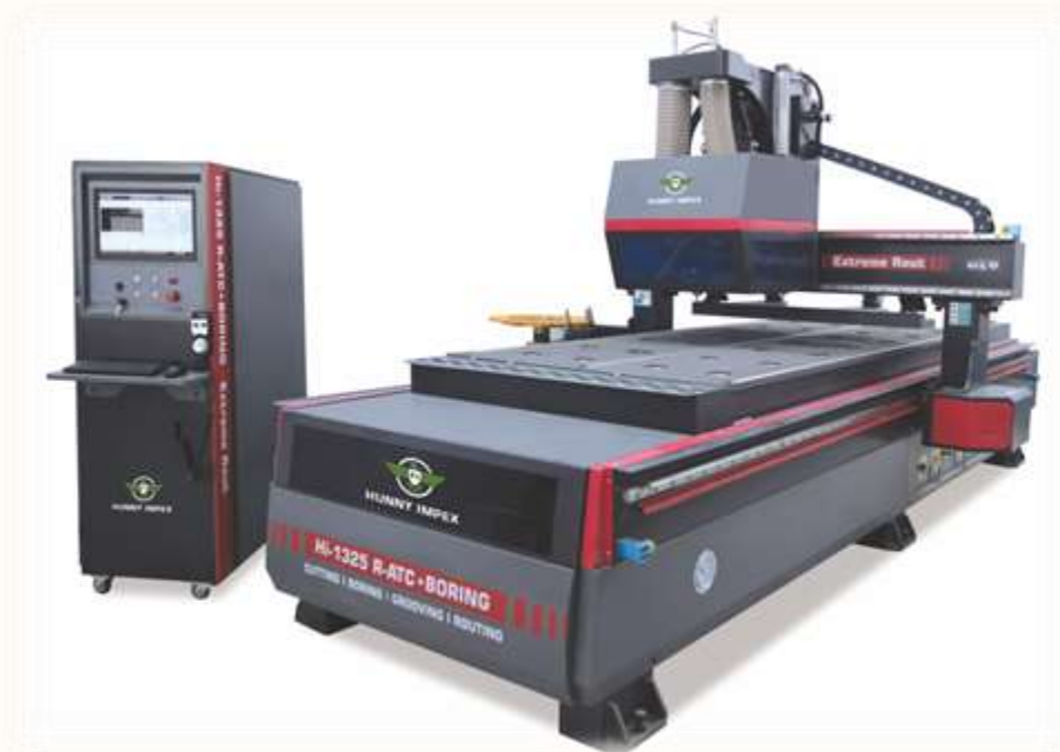
Hi-1325 R-ATC+BORING CNC ROUTER