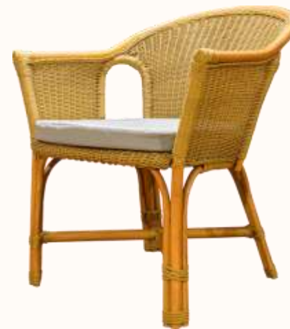
Rattan Wicker Chair