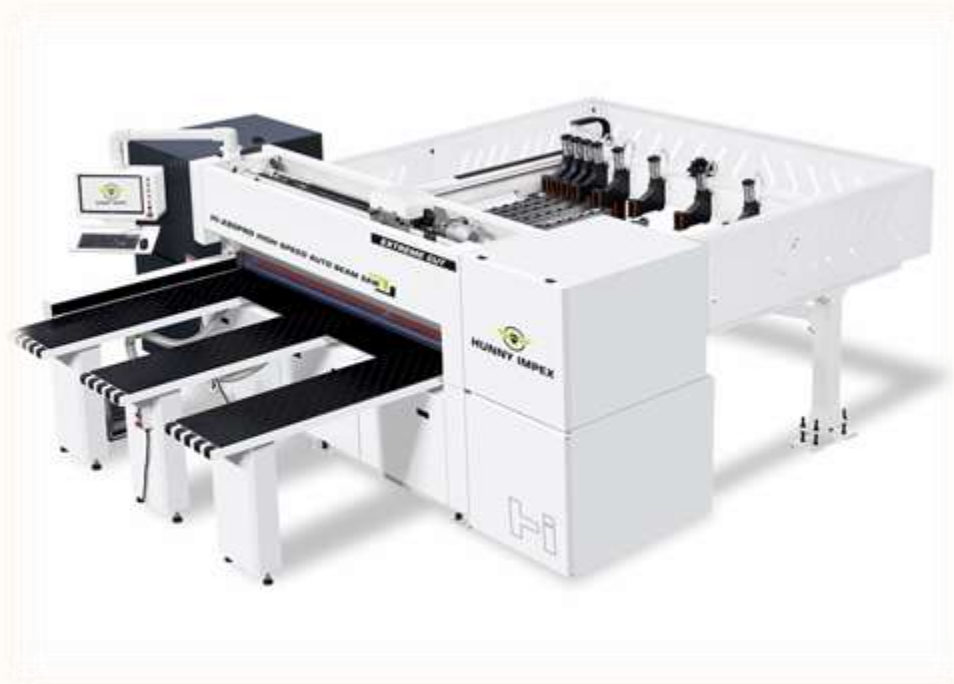
Hi-280 PRO High Speed Auto Beam Saw