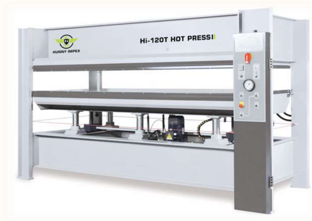
Hi-120 T Hot Press