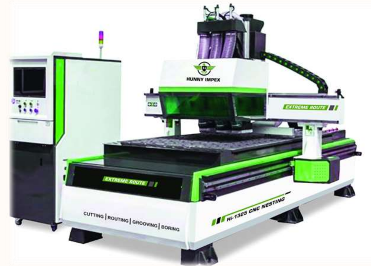
Hi-1325 Nesting CNC Router