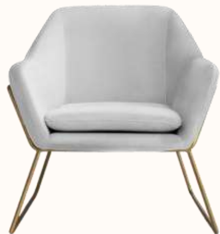
Aesthetic Single Chair