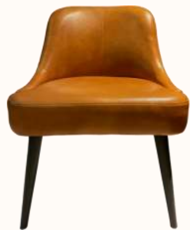
Leather Single Chair