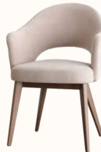
Single Pink Chair