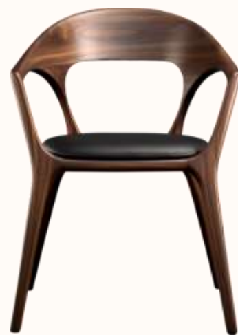
Aesthetic Wood Chair