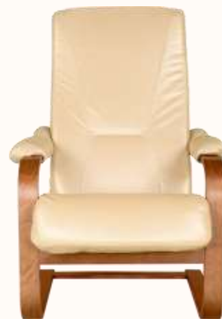
Premium Single Chair