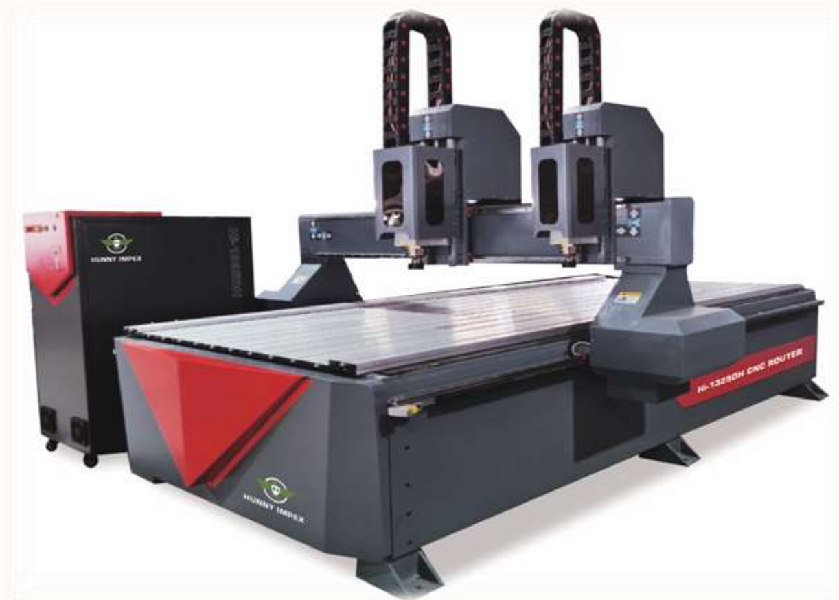
Hi-1325 DH Double Head CNC Router